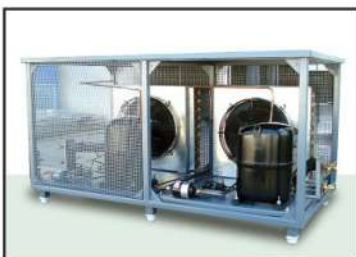
Stand by Refrigeration system